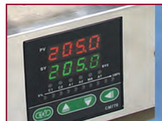
Accurate digital temperature control