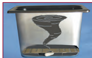
Nonstick Vat and stirring bar. Nonstick (Vat) prevents dyes from sticking and caking to the walls, therefore making vat cleaning easy.