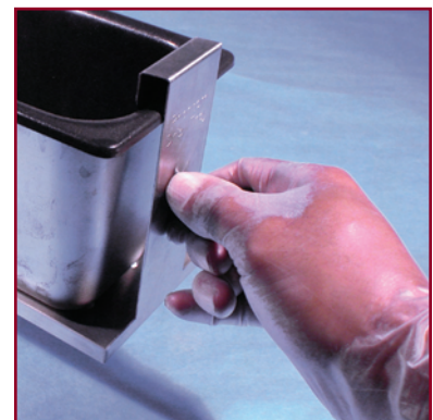
These gloves are ideal for handling chemicals in the optical laboratory.

Packaged in a 10 3/4 x 5 5/8 x 3 1/8 box, (27.30 x 14.29 x 7.94 cm), shipping weight/box of 100: 2.7 lb., (1.2kg).