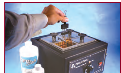
Tinting is simply done by dipping lenses into hot dye solution.