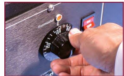
Thermostat control dial offers accurate adjustment of the temperature.