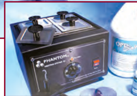
4 mini tanks option