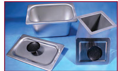
Stainless steel quart and mini tanks (vats). Each quart tank can be replaced with two mini tanks.