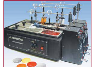
For Volume Production: Three Phantom Automatic Lens Tinting Machines can be aligned next to each other to hold up to 24 lenses.