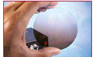
The design and accurate control of the Phantom® Automatic Lens Tinting Machine Model 95 produces smooth gradient tints

State-of-the-art, microcomputer controlled, Automatic Lens Tinting Machine with dual digital time displays to show the tinting cycle set time, and also the remaining cycle time. Developed for both solid and gradient tinting with absolutely no lines. Free-standing machine, takes only a matter of seconds to set up, is easy to use, and features virtually silent operation. Versatile arm can rotate 360 degrees, and can accommodate up to four pairs of lenses at one time. Machine features continuous agitation of the dye solution, offers a 30 Second to 60 minute timer with dual digital time displays, and an electronic beeper to indicate cycle completion.