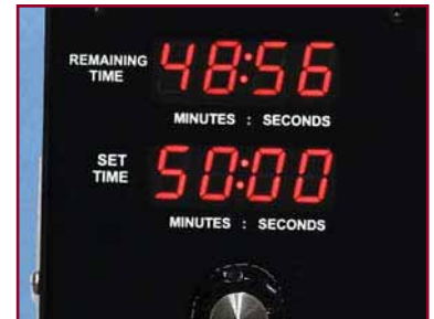
Dual digital time displays